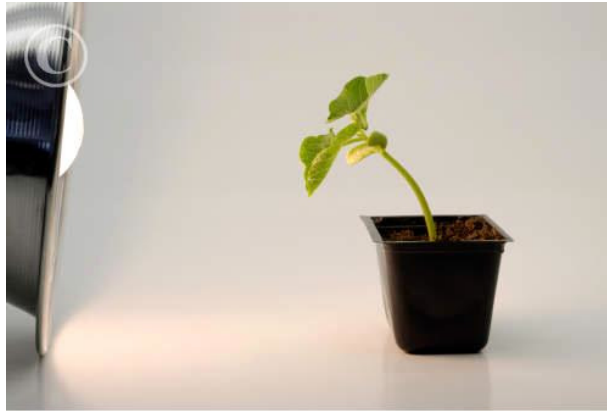
BG1097 [RM]

Phototropism is plant growth or movement in response to light.