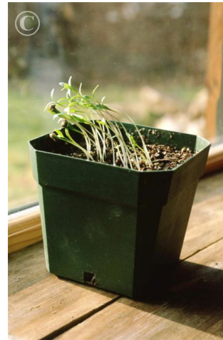
AC858A [RM] © www.visualphotos.com

If you have ever noticed a vine wrapped around a fence, you have seen an example of thigmotropism .